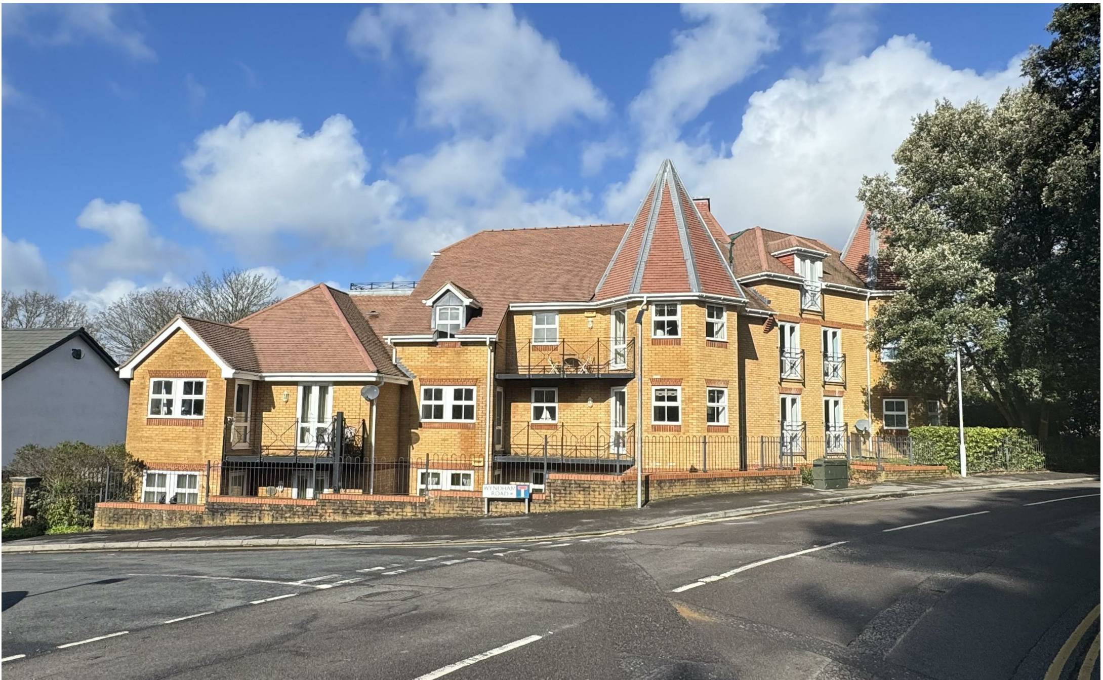
Penthouse 9 Grosvenor Heights 2 Wyndham Road, Poole BH14 8SR £415,000 Leasehold